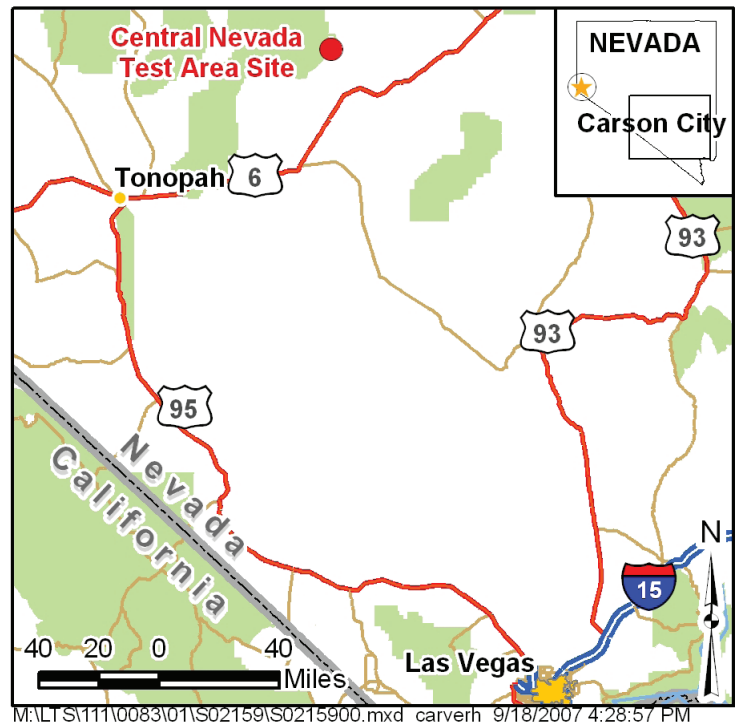
Location of the Central Nevada Test Area, Nevada

The Hot Creek Valley fill consists of poorly sorted alluvium composed primarily of volcanic rocks derived from the adjacent ranges. The alluvium is underlain by volcanic tuff and sedimentary rocks derived from volcanic material and welded tuffs interbedded within a volcanic rock sequence.